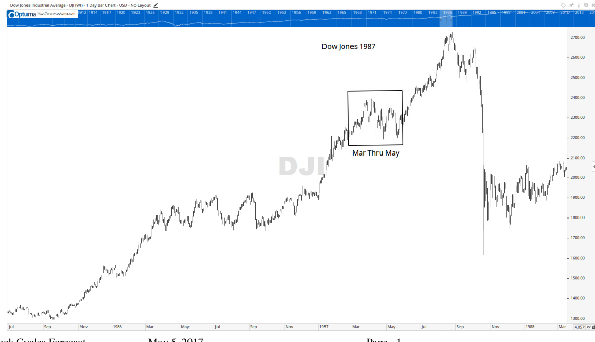
Stock Cycles Forecast

the Bradley Astro Model has the high for the next three years in mid 2017 so it is likely we are about to see a culmination. Whether that's a runaway upside spike or a roll over top remains to be seen, so strategies will focus on scalping long above 2380 using close stops and raising cash on each advance.